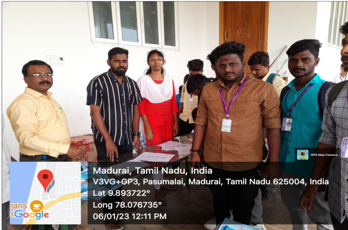
Photo: BIS Foundation Day on 6 th January, 2023