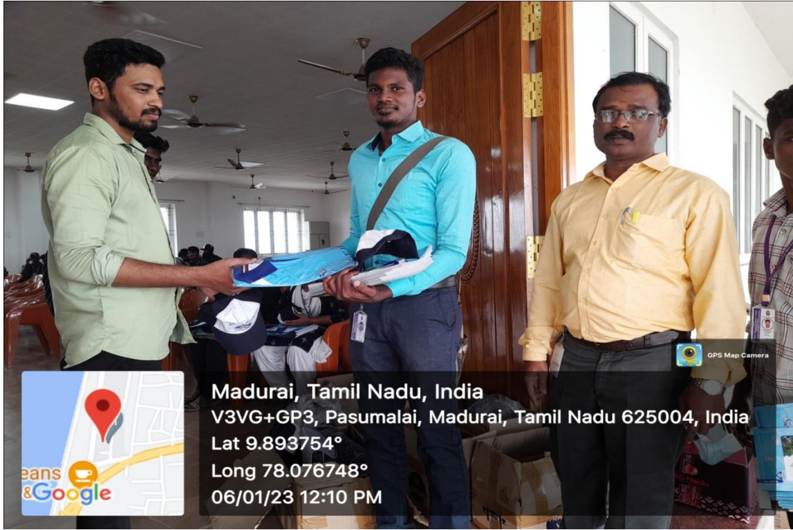
Photo: BIS Foundation Day on 6 th January, 2023